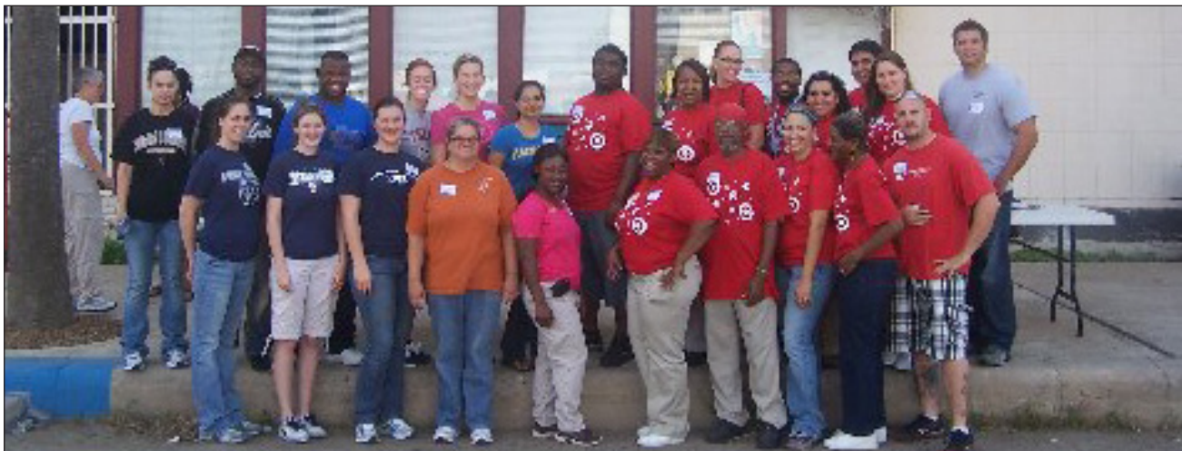
Community volunteers help The Jesse Tree help others. Be a Jesse Tree volunteer. Call, email or write The Jesse Tree today!