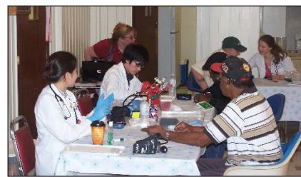
Volunteers assist The Jesse Tree in the Senior Food Box Program.

Volunteers please call 409-762-2233 check the website at www.jesstree.net , email us at info@jesstree.net or write us at PO Box 575, Galveston, TX 77553.